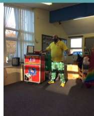
Taz Children's Entertainer comes to Nursery